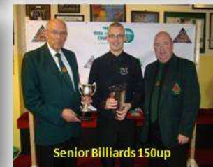
Senior Billiards 150up