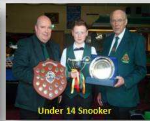
Under 14 Snooker