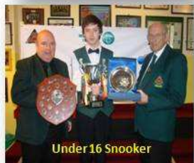
Under 16 Snooker