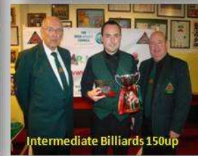
Intermediate Billiards 150up