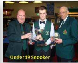
Under 19 Snooker