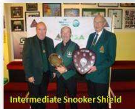
Intermediate Snooker Shield