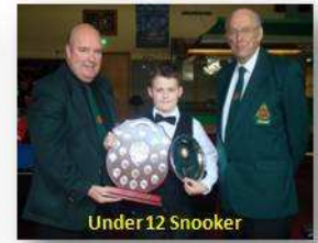
Under 12 Snooker